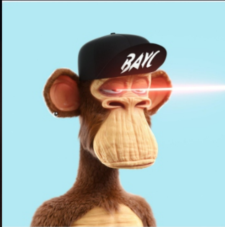
Bored Ape Yacht Club(NFT)